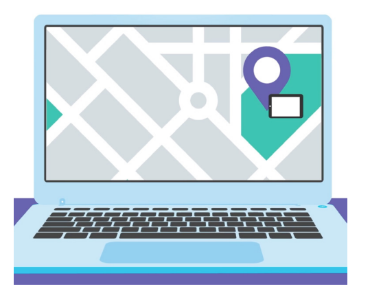
Find My lets you use your computer's web browser to see the location of your missing device on a map

Your iPad should still be showing the Find My iPad menu.